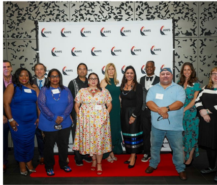
AIHFS Staff (2024)