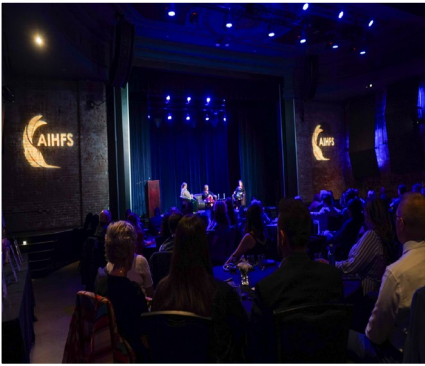
Keynote Panel on the Urban Indian Experience (2024)