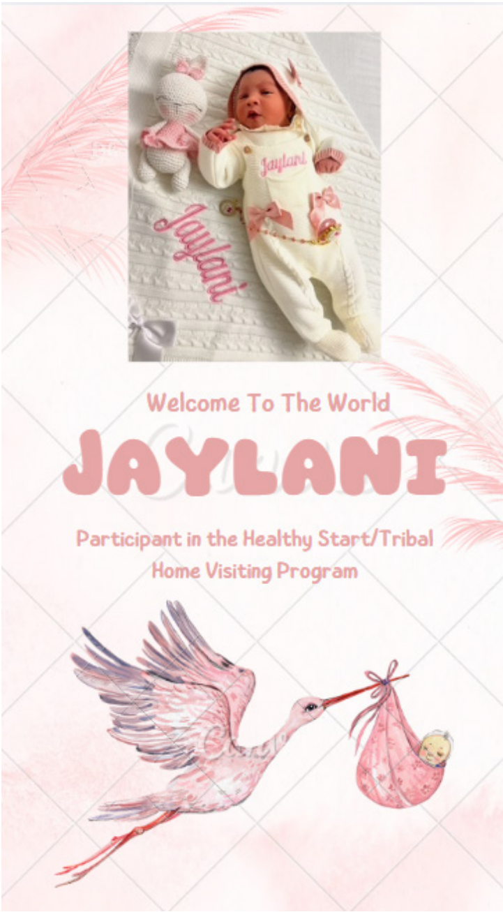
Healthy Start Tribal Home Visiting